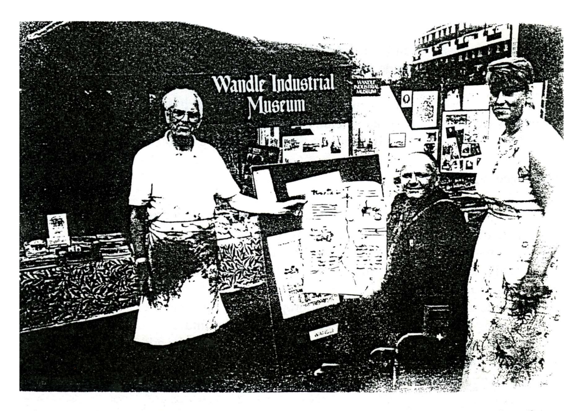
THE MAYOR OF MERTON LAUNCHES THE NEW WANDLE TRAIL MAP AT MERTON GREEN FAIR